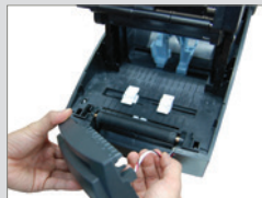
Auto-Cutter : Easy installation